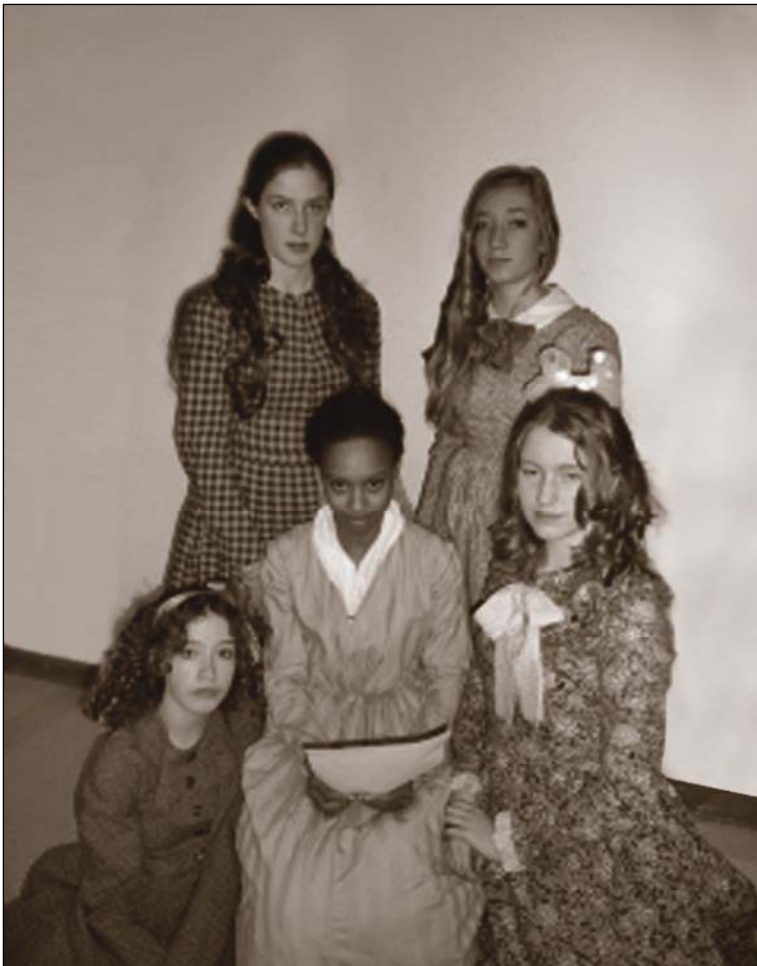
Eighth Graders in costume for the play

p.m.; Thursday, February 9 at 10:15 a.m.; and Thursday, February 9 at 7:00 p.m. All performances will be in the Multipurpose Room. Please come to any performance and experience the magic of growing up.