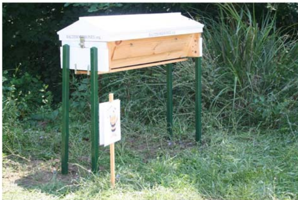
Left: WSB's own beehive

UNICEF collects funds for famine relief in Somalia. Online donations are accepted. Please visit United States Funds for UNICEF: https://secure.unicefusa.org/site/Donation