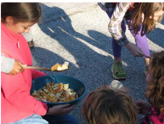
Students sampling fruit.