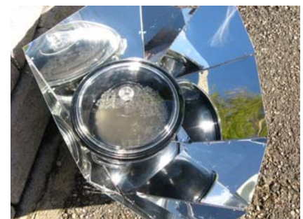
Right: WSB solar cooker