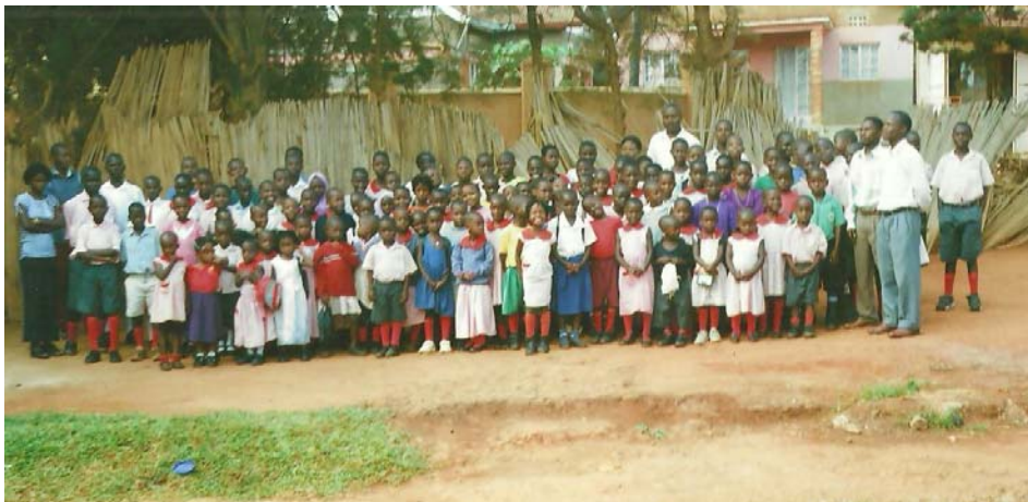
Students and teachers of Bright Star Junior School, Uganda

Sponsored by the Green Committee and WSB Upper School students' Sustainable Projects class