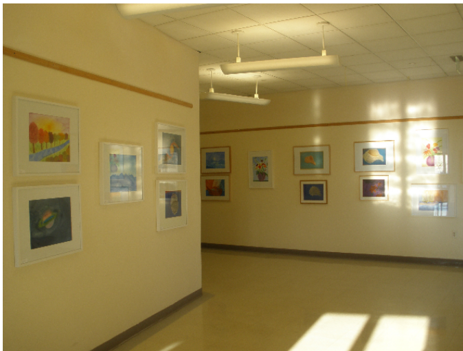
Two views of the Tamarind Building gallery space.