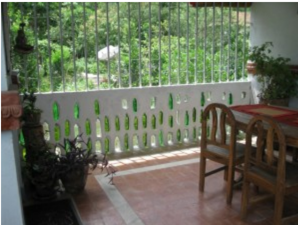
Left, a bottle wall; right, shell and seed jewelry.