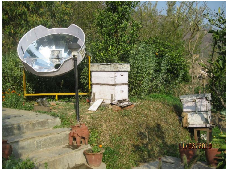
A solar cooker.