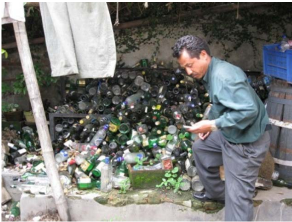
Sorting bottles in Nepal.