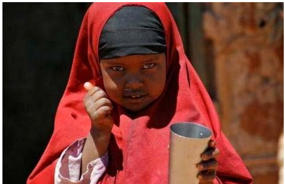
Ethiopia, 2008.