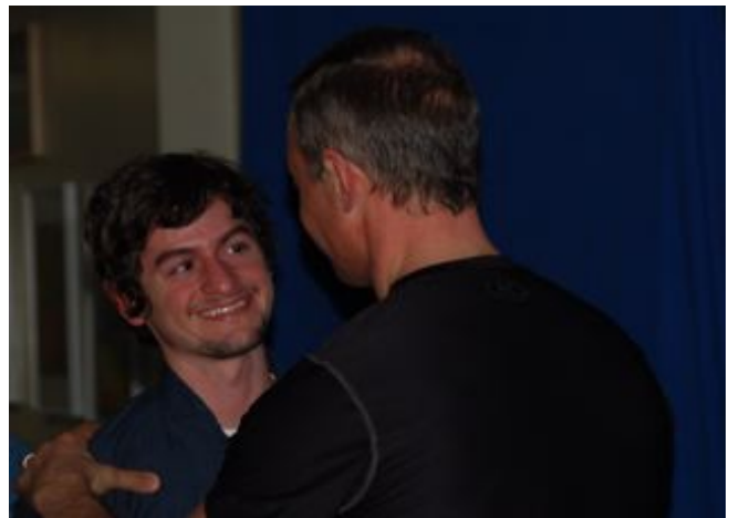
Left: O'Malley's March onstage.