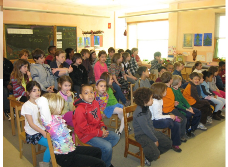
Right: Students in grades 1-3