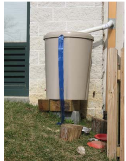
Above: WSB rain barrel.