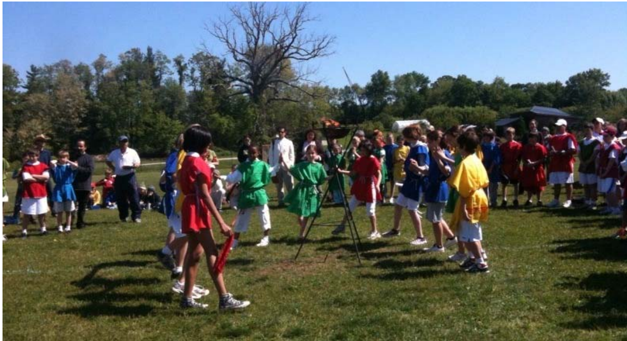
WSB fifth graders at the Olympics at Kimberton Waldorf School, Thursday, May 13. The Olympic flame is in the center.