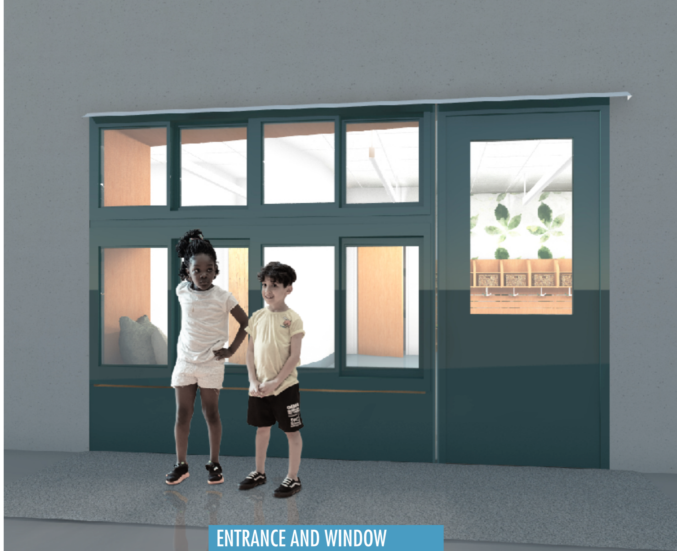
ENTRANCE AND WINDOW