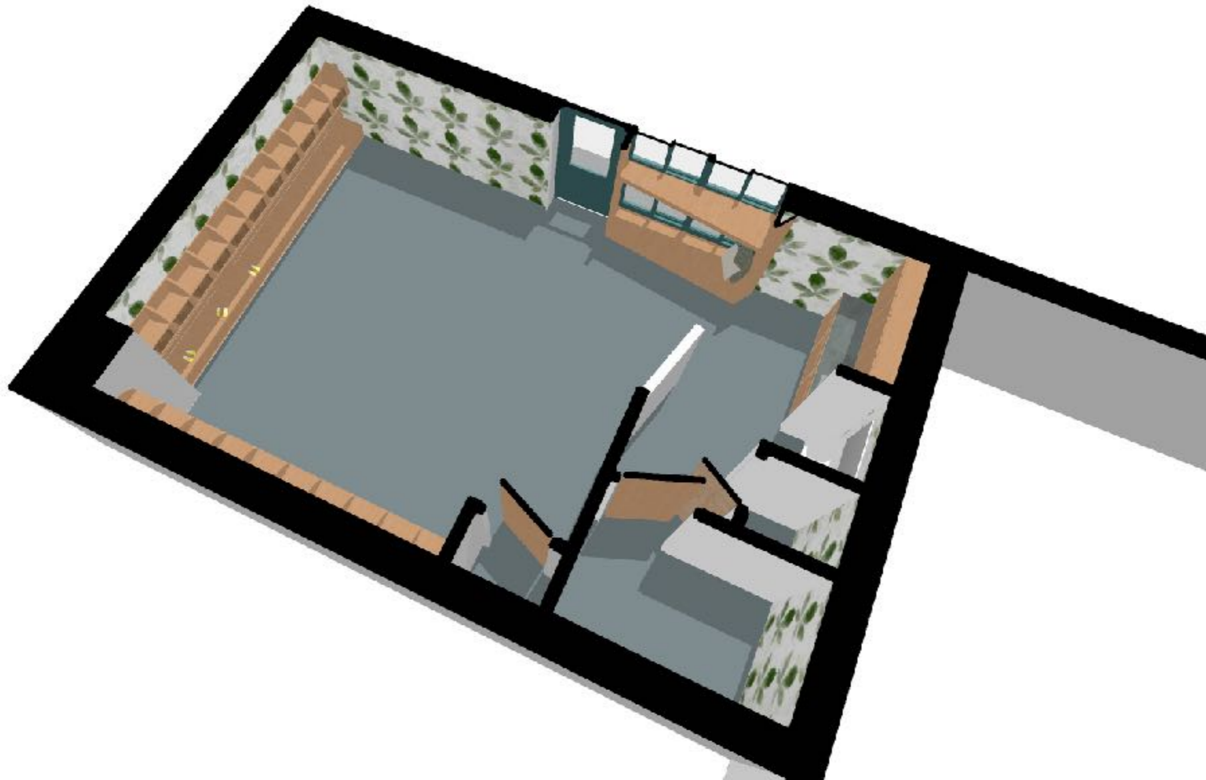
MODEL VIEW 2